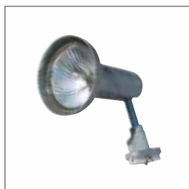
Spot halogen SYSTAR100W EUR 24.00 Cod 019.010.185.000