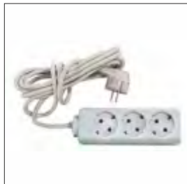
Prelungitor 230V, 10A, 3m EUR 18.00 Cod 019.010.277.000