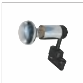
Lampa spot 100W EUR 21.00 Cod 019.010.188.000