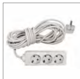
Prelungitor 230V, 10A, 5m EUR 18.00 Cod 019.010.279.000