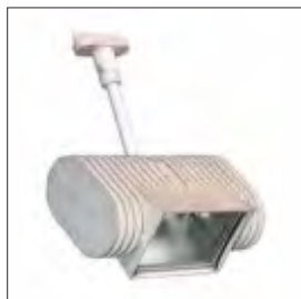
Reflector halogen SYMA STAR 300W EUR 50.00 Cod 019.010.200.006