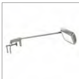
Reflector tija LED A++ EUR 50.00 16W 1100LM 4000K ARM33CM Cod 019.010.200.040