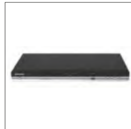
DVD Player EUR 55.00 Cod 025 010 130 030