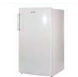
Frigider ARCTIC FB 155 EUR 36.00 Cod 025 010 020 198