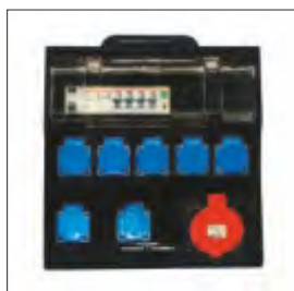
Panou Electric 380V/220V EUR 130.00 Cod 019.010.265.000