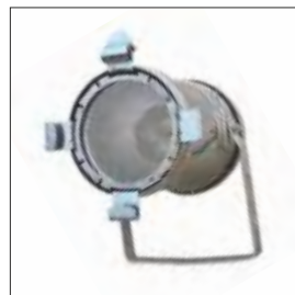
Reflector HIGHLITE HQI 150W 50.00 EUR Cod 019.010.390.000