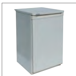
Frigider ARCTIC (180 l) EUR 59.00 Cod 025 010 070 020