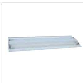
Corp fluorescent tip OCTANORM EUR 29.00 cu doua tuburi D-171 Cod 019.010.200.000