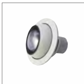
Lampa spot 100W EUR 21.00 Cod 019.010.170.000