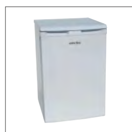
Racitor (140 l) EUR 33.00 Cod 025 010 070 010 (55 x 61 x 84 cm)