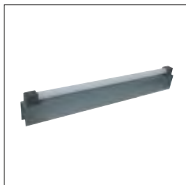
Corp fluorescent tip SS30 EUR 24.00 cu un tub D-170 Cod 019.010.190.000