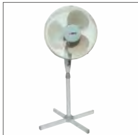
Ventilator cu picior EUR 14.00 Cod 025.010.500.020