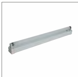
Corp fluorescent tip SS30 EUR 27.00 cu un tub D-170 - A Cod 019.010.190.001