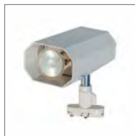
Spot halogen SYSTAR 50W(A) EUR 24.00 Cod 019.010.186.000