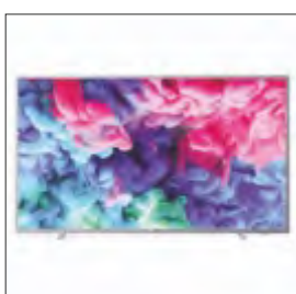
TV LED SMART 4K, UHD ultrasubtire EUR 55.00/zi (diagonala ecran: 126 cm) Cod 025 010 130 045