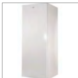
Frigider ARCTIC 255 l EUR 80.00 Cod 025 010 020 199