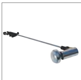
Lampa spot cu brat EUR 21.00 Cod 019.010.180.000