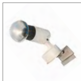
Lampa spot SS30 100W EUR 21.00 Cod 019.010.200.008