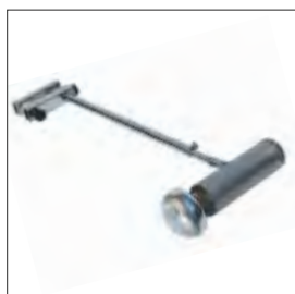
Lampa spot cu brat 100W EUR 21.00 Cod 019.010.181.000