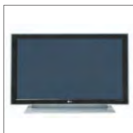
TV Plasma EUR 36.00/zi (diagonala ecran: 107 cm) Cod 025 010 130 040