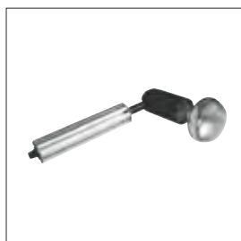
Lampa spot stut OCTANORM EUR 21.00 Cod 019.010.187.000