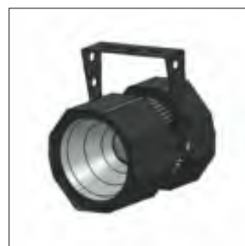
Reflector LED VIRGO EUR 55.00 40W 4350 LM 4100 K Cod 019.010.200.045