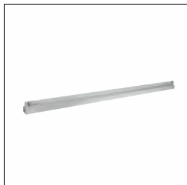
Lampa fluorescenta FIA EUR 24.00 cu instalatie electrica completa 1x40W Cod 019.010.110.000