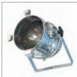
Reflector PAR64 500-1000W EUR 55.00 Cod 019.010.200.020