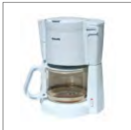
Filtru de cafea EUR 10.00 Cod 025.010.120.010