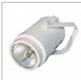
Reflector HQI 80W EUR 50.00 Cod 019.010.200.030