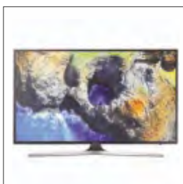
TV SAMSUNG UHD, EUR 85.00/zi (diagonala ecran: 163 cm) Cod 025 010 130 047