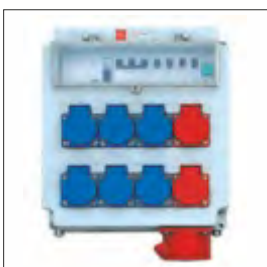
Panou Electric OCTANORM EUR 210.00 Cod 019.010.275.000