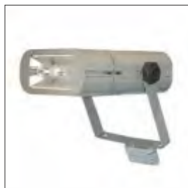
Reflector IVEN HQI 150W EUR 50.00 Cod 019.010.200.005