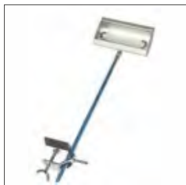
Reflector cu brat 300W EUR 50.00 Cod 019.010.200.010